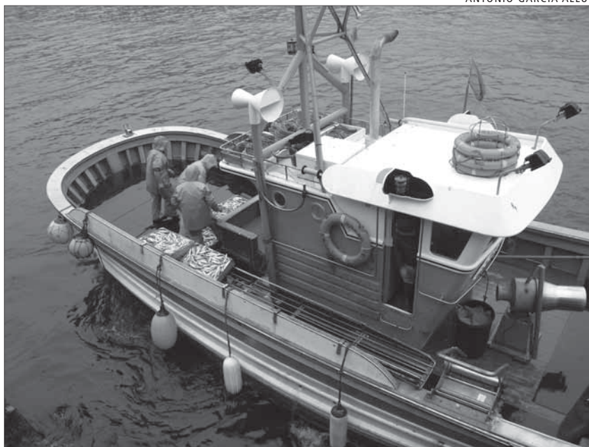
Fishermen preparing the bait on a longline fishing vessel in Cedeira, Galicia, Spain. Small-scale fisheries management in Galicia is sometimes led by fishermen's organizations